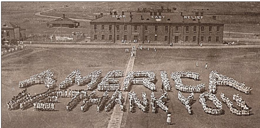
"Orphan City" 30,000 Armenian orphans in NER's largest orphanage in Alexandropol. (1923)

Founded in 1915, the currently-named Near East Foundation (formerly known as Near East Relief or NER) is the United States' oldest Congressionally-sanctioned non-governmental organization which for the first time in American history expressed the collective generosity and humanitarianism of the American People. The NER served as a model upon which future philanthropic organizations, including the U.S. Peace Corps and USAID, and future calls for overseas relief efforts known as "citizen philanthropy" were modeled.